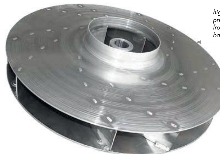
high performance middle- pressure fan wheel riveted from aluminum bright, backward curved