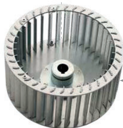
galvanized drum wheel made of sheet steel (stainless steel on request)