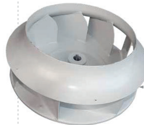
low-pressure-fan wheel welded from sheet steel, painted