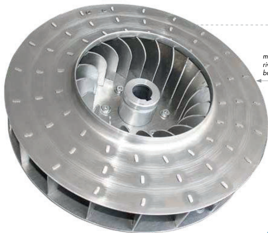
middle-pressure-fan wheels riveted from aluminum bright, forward curved