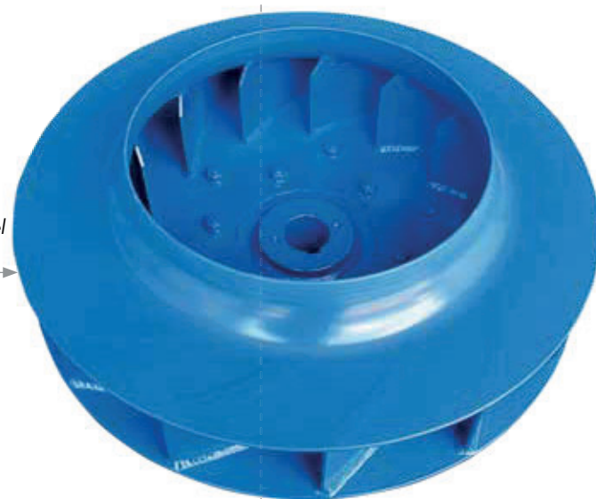
high-performance fan wheel steel welded, painted